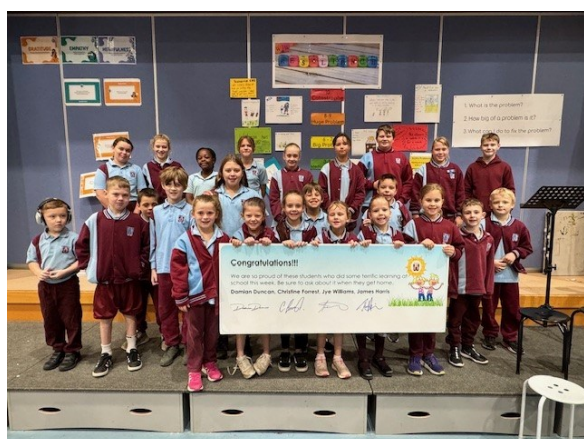
Our Happy Card Recipients of the week! Congratulations!