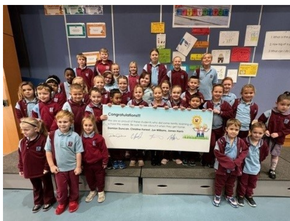
Our Happy Card